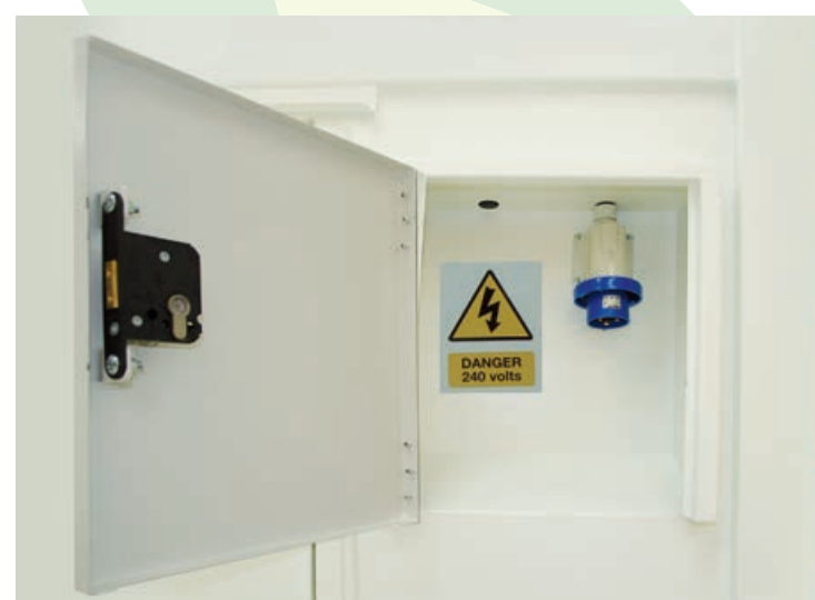
Power input socket for 240V mains electricity supply

The 1.5" stainless Steel ball valves connections can be contained within a lockable steel housing if required